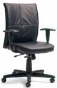
desk chair TS31301