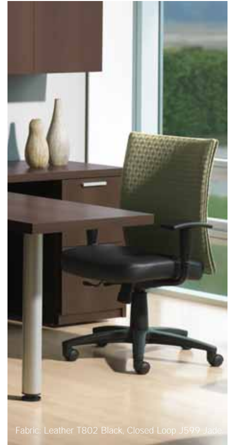
Fabric: Leather T802 Black, Closed Loop J599 Jade.