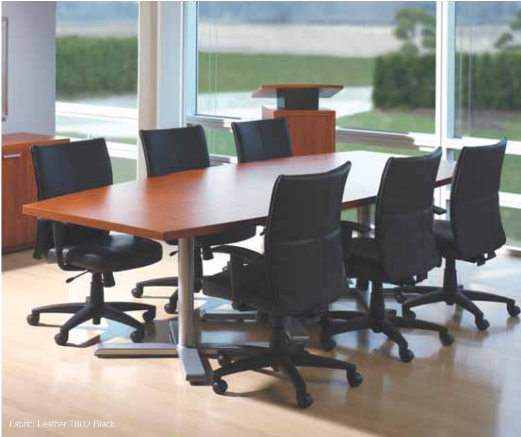
Fabric: Leather T802 Black.