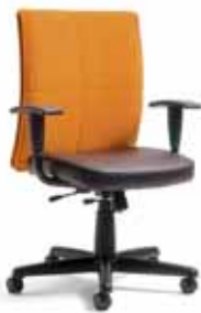
desk chair TS31301 with COM