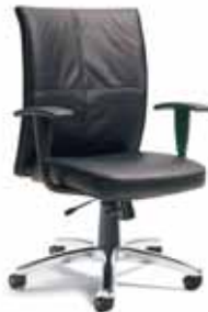
desk chair TS31301 with polished aluminum base