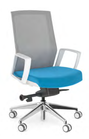
Fixed Loop Arms